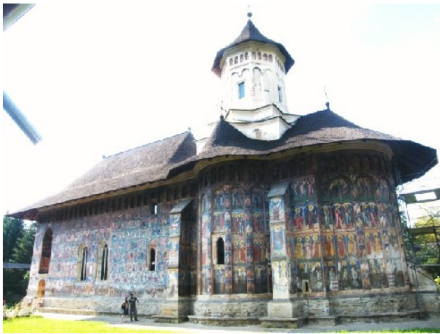
Voroneț Painted Monastery

and visited the amazing project run by the local psychotherapist and his team with the (now grown up) 'children' with severe physical deformities and learning disabilities who featured so prominently in the western media after the fall of the Iron Curtain and the demise of the Ceausescu regime.