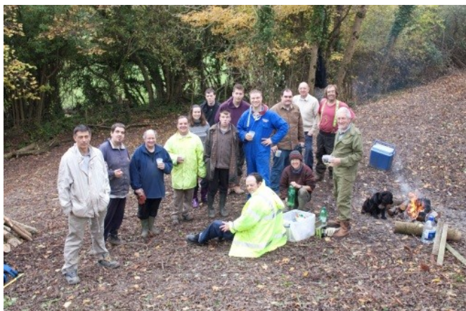
Tea Break at Cerne

Dorchester, Blandford and Yeovil and lay on minibus transport from Weymouth so that the group now regularly numbers over 15. This includes six people from the Southill Centre in Weymouth who are really enjoying taking part in this work.