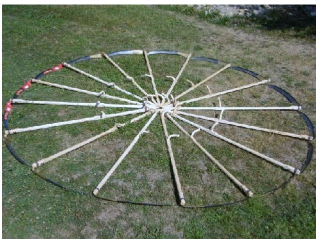
A circle of Romanian scythes

There are plenty of possibilities in Siret for future EuCAN involvement particularly as ecotourism is virtually nonexistent and the local economy would benefit from initiatives in that area.