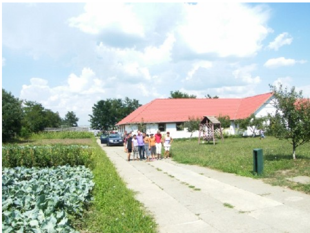
Siret sheltered housing with vegetable gardens

and visited the amazing project run by the local psychotherapist and his team with the (now grown up) 'children' with severe physical deformities and learning disabilities who featured so prominently in the western media after the fall of the Iron Curtain and the demise of the Ceausescu regime.